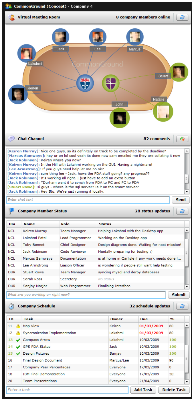
Figure 1. CommonGround running on Facebook

encounters), increased status awareness (via status updates), and greater project planning potential both locally and cross-site (via a simple company-wide task list).